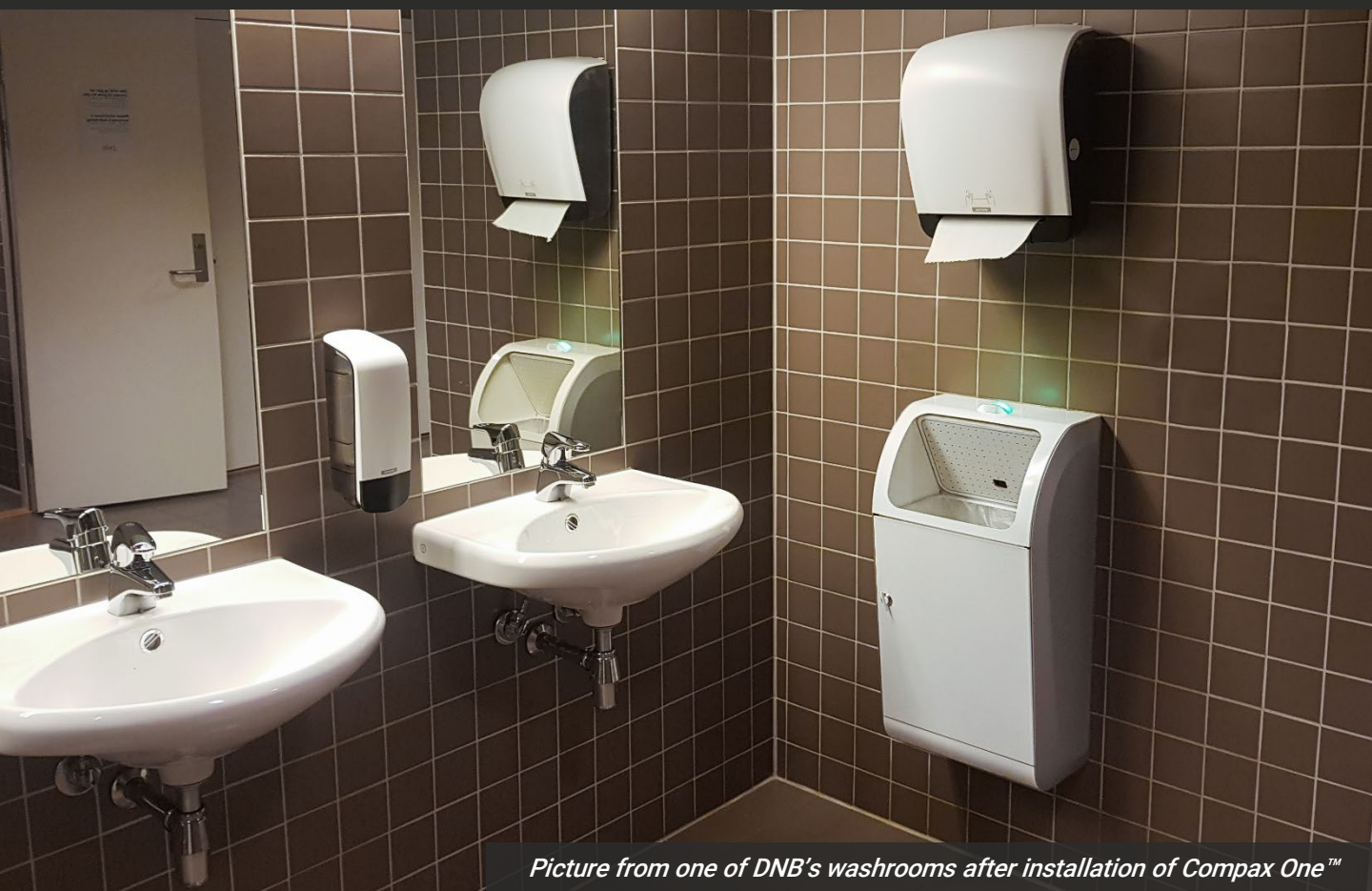
Picture from one of DNB's washrooms after installation of Compax One™