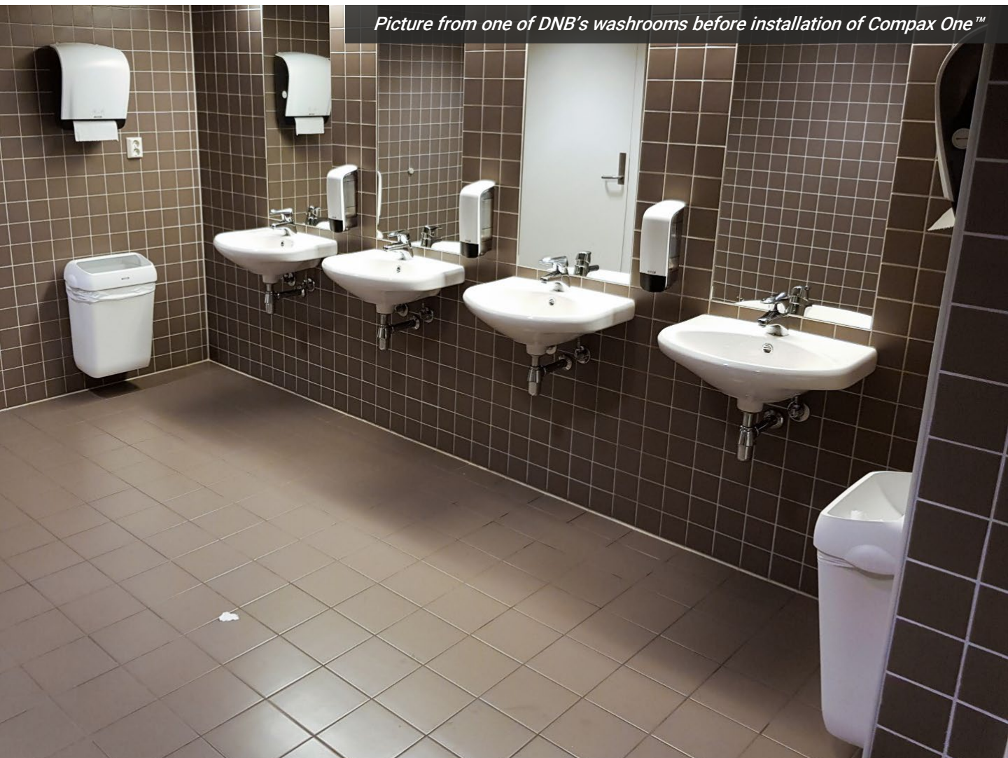
Picture from one of DNB's washrooms before installation of Compax One™

The cleaning staff at DNB clean the washrooms at least two times a day. With a total of five waste bins on their two most busy washrooms they have to change plastic bags at least 10 times a day, and even more often during large events. With this as a daily routine, both DNB and Sodexo wanted to challenge Compax to reduce the number of plastic bags DNB uses in these washrooms.